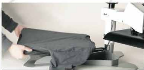
Dress / Thread from the back (Shirts right-side up!)

Our exclusive SuperCoil-Microwinding™ heater technology guarantees perfect uniform heat to the edge - outperforming and out heating all others, with Lifetime Warranty!