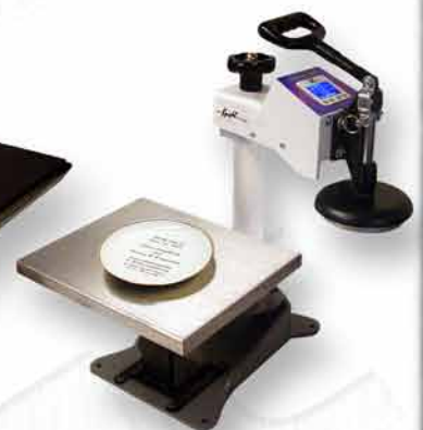
Plates / Custom